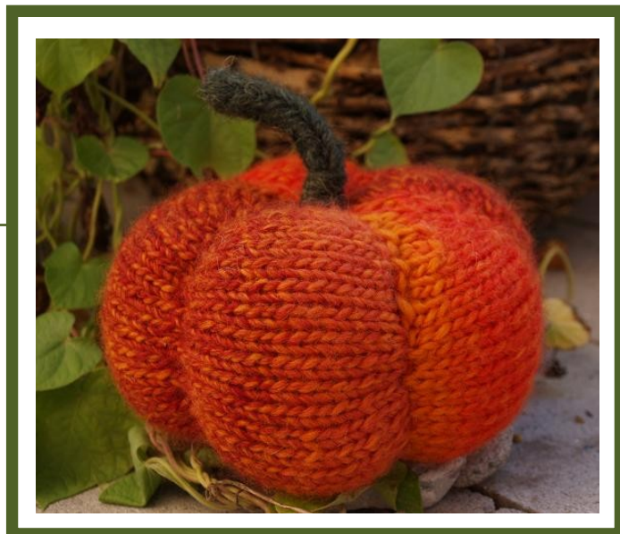
Finished size: 6" across & 3¾" tall (without stem)